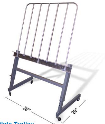
Optional Plate Trolley

All units are electrical UL® and CUL® tested and certified.